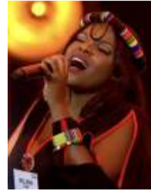
NEWCASTLE IKHANKASELA ONGENELELE UMNCINTISWANO WAMA IDOLS NGETHEMBA PAGE 7