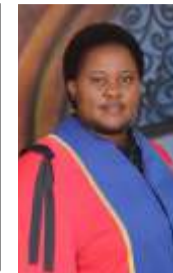
SIXOXISANA UBUSO NOBUSO NOSOMLOMO WASENEWCASTLE PAGE 8