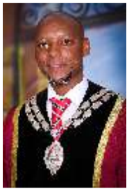
UMLAYEZO KAMEYA PAGE 1