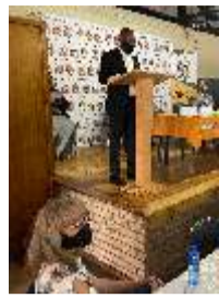
ZISHINTSHILE IZINTO NGEMFUCUZA PAGE 5