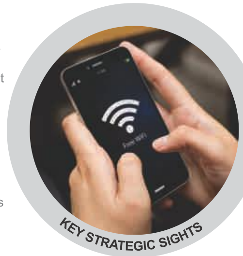
KEY STRATEGIC SIGHTS

The KZN EDTEA Wi-Fi project comes at the time where the municipality has been working on making municipal services available via a secure Customer Services Portal which will allow citizens of the town to gain access to their utilities accounts, make payments online and gain access to meter readings. On the back-end, the portal will also assist in managing hall bookings. The portal will be launched before the end of this financial year.