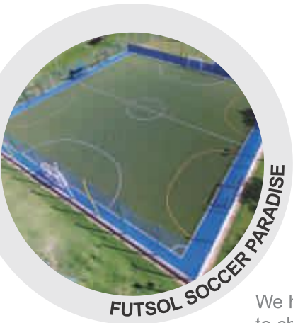
FUTSOL SOCCER PARADISE

The council approved the ALIVE AFTER 5 concept last year, which saw street entertainment and night stalls being introduced into the CBD in an effort to attract more people to shop there and enjoy extended shopping hours during the festive season.