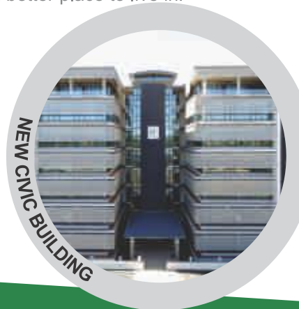
NEW CMC BUILDING

It will also be a fitting addition to the municipal precinct alongside our tower block and town hall.