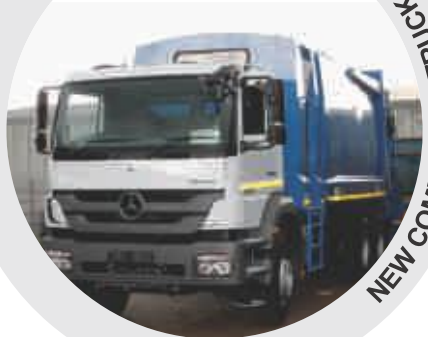
NEW COMPACTOR TRUCK

We argued the case of "one city,one service", and reengineered the department to embrace this motto. Today, Honourable Speaker, we have eleven brand new compactors, one front end loader, one roll on truck, one tipper truck, three cranes with grabs and two skip trucks. All brand-new and ready to service our communities.