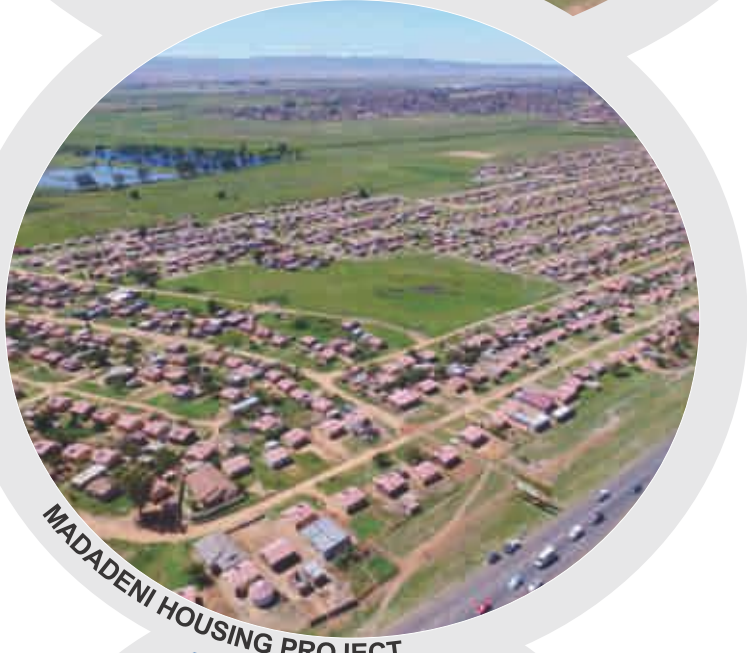
MADADENI HOUSING PROJECT