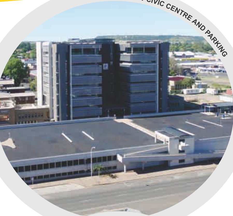
NEW CIVIC CENTRE AND PARKING