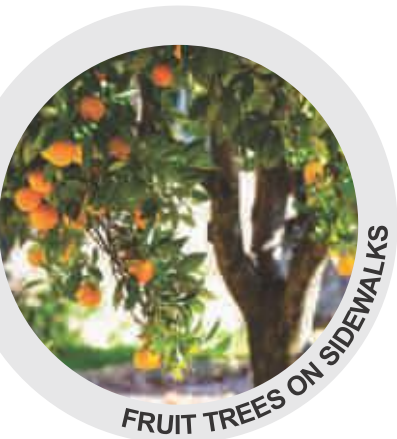
FRUIT TREES ON SIDEWALKS

However, I said in the beginning that I want to talk about the future too. I therefore am proud to announce that in the next few months, council will identify streets where, instead of planting normal trees, fruit trees will be planted. We want to see the streets of our suburbs and townships bearing orange, peaches and other fruit. We want to provide nutrition to commuters and children who walk on these sidewalks, whilst also fighting soil erosion and providing shade. I open the challenge to each and every resident to plant a fruit tree in front of their home and all businesses to join us and sponsors trees for the more disadvantaged areas.