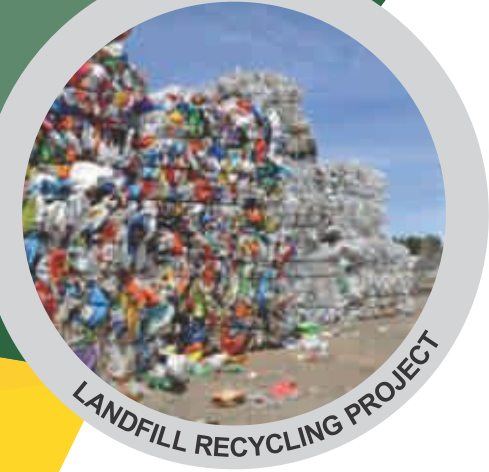
LANDFILL RECYCLING PROJECT

This is what we mean when the President calls for going back to basics. Siyaqhuba!