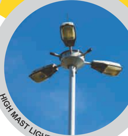
HIGH MAST LIGHTS

We have electrified households in Charlestown, Normandien, Dickshault, Ingogo, Bosworth, Vezubuhle, Fairview and Mndoza. R8,5 million has been budgeted to electrify more areas. The Siyahlalala suburb alongside Fairleigh will get R6 million towards the first phase of electrifying the 1200 houses that are earmarked to be built in the next few months. This goes together with the R20 million for bulk water and sewer in that area.