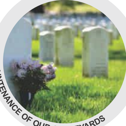
MAINTENANCE OF OUR GRAVEYARDS

In the last 2 weeks, we have established a cemetery grass cutting team which will only focus on keeping our cemeteries neat. in collaboration with our local farmers, we are using grass cut to be bailed and used as cattle feed, especially in a time when the province is still reeling from the effects of late rainfall. This will also assist us to save costs, and extend our reach even further.