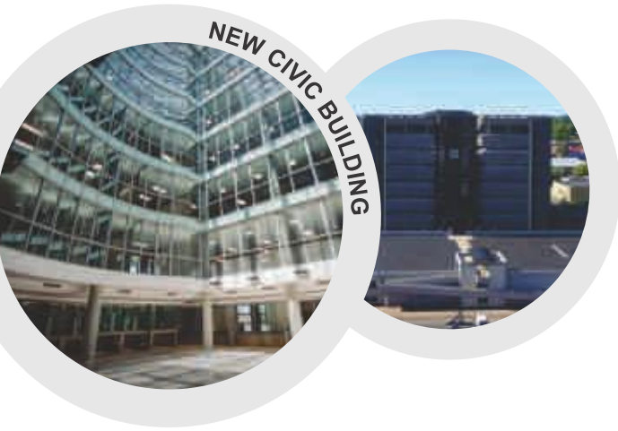
NEW CIVIC BUILDING

Moving further towards a smarter city, The Newcastle Municipality is determined to implement cutting edge technology that will help us spend ratepayer's money more efficiently and to reduce operational costs. In 2016/17, we will be building a world-class Municipal Area Network and Voice cloud to improve service delivery and turnaround times to the citizens; to improve the efficiency of municipal employees and systems; to reduce operational expenditure; to reduce the municipality's dependency on a single telecoms service provider – as we have seen with the lack of service availability due to cable theft; and to consolidate and simplify the municipality's data and voice infrastructure. This implementation will see the municipality save as much as 40% on annual voice costs. The return on investment will be realized in as early as 9 months of implementation and the savings will mainly come from the fact that telephone calls between municipal buildings will now be carried by the municipal data network.