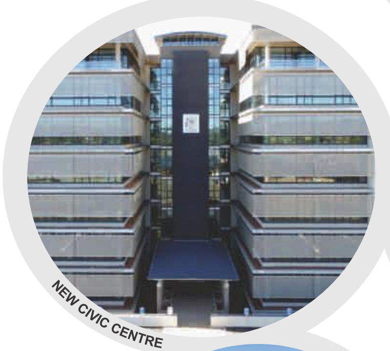
NEW CIVIC CENTRE