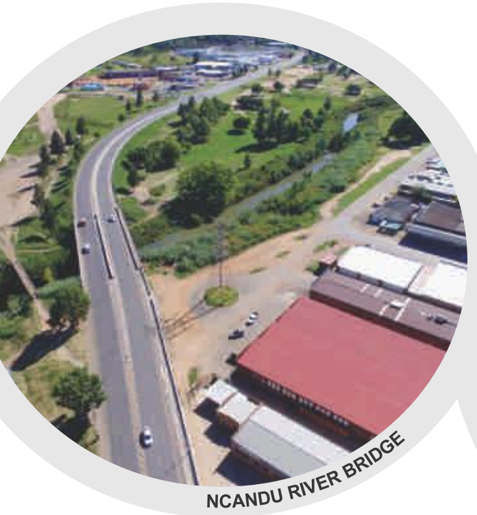
NCANDU RIVER BRIDGE