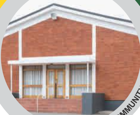
JBC COMMUNITY HALL

We are in the process of completing two new halls in the JBC and Charlestown areas, and these will be fully furnished and ready for use before July this year. We have air conditioned the show hall, and now budgeting R300 000 for generators to power the Madadeni and Osizweni halls in the event of electricity load shedding in the eskom licence areas