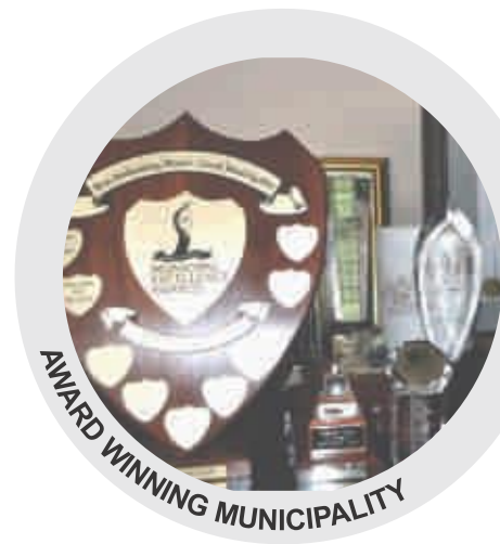
AWARD WINNING MUNICIPALITY

The 94% customers satisfaction survey of being number 1 in the province, the cleanest town awards, the Govan Mbheki award, the most innovative infrastructure award and the 3 consecutive wins of best performing mayor in KwaZulu Natal, are proof, Honourable Speaker, that we have a winning formula and lead a great team. In this regard, I would like to theme the budget 2016/17 "reaping the fruits of our labour - sivuna umvuzo wezithukuthuku zethu". To celebrate this, each councillor will find on /her desk a bowl of fruit, so that they can taste the fruits of their labour. Indeed Siyaqhuba!