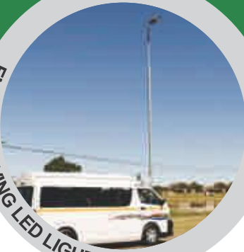
ENERGY SAVING LED LIGHTS

We continue to lead the way with converting our street lights into LEDS, thereby reducing our electricity usage and providing brighter lights on our streets. R5 million more has been budgeted for this. Street lights already adorn the P483 main road from Newcastle to Osizweni, the complete township of Ingagane, and a partial takeover of Eskoms facilities in Madadeni and