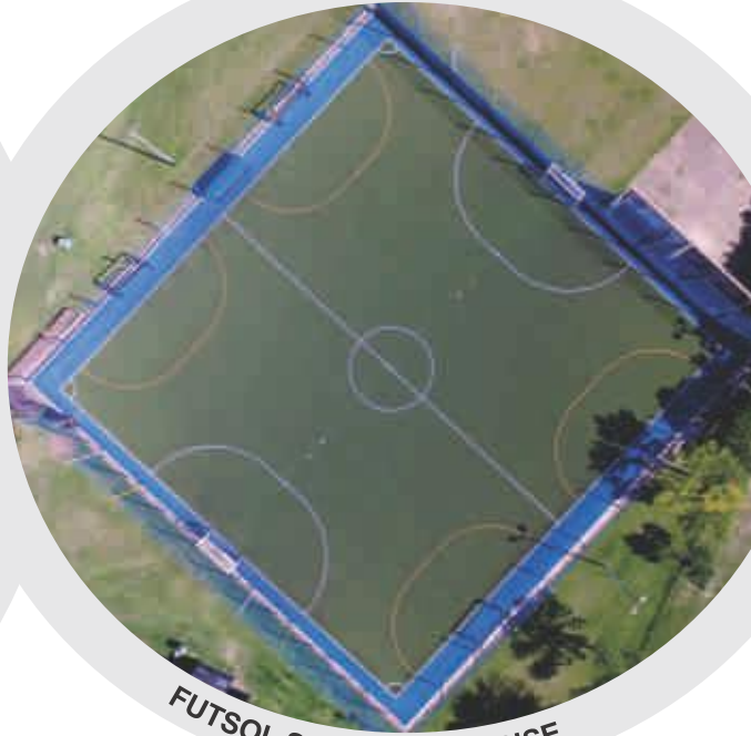
FUTSOL SOCCER PARADISE