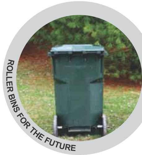
ROLLER BINS FOR THE FUTURE

I am still not satisfied that we still collect refuse in bin bags, whereas most first world countries are now using roller bins to be left out by residents. The department has been tasked with urgently investigating this option, and 2016/17 should see a partial rollout of this method in suburbs. This will go a long way in keeping our city clean, as the roller bins will not be able to be dropped and spread by neighbourhood dogs.