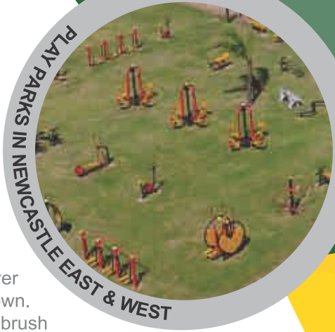
PLAY PARKS IN NEWCASTLE EAST & WEST

We have raised the bar when it comes to building new play parks in this country with our state of the art playground and outdoor gym equipment. We will complete two more park. in Madadeni and Osizweni and upgrade the 3 exiting parks in NN west already budgeted in this current financial year.